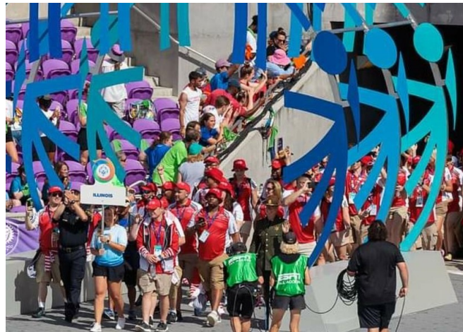
Illinois participants marching in at Opening Ceremony